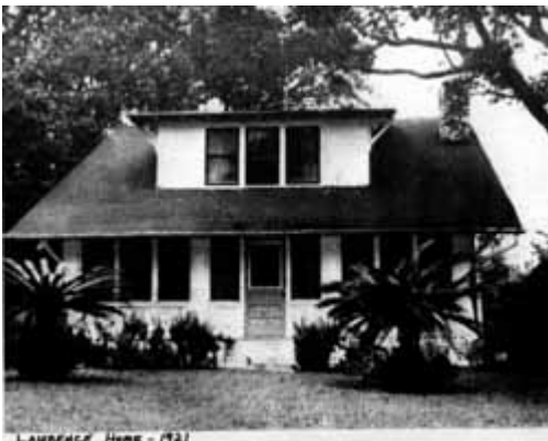
Lawrence Home 1921

In those early days Brooklyn consisted of a large unpainted building called the Brooklyn Hotel; a combination general store and post office; and several small houses scattered about. The Lawrences' temporary home was in one of those houses. The original Lawrence Developing Company also occupied one of the houses.