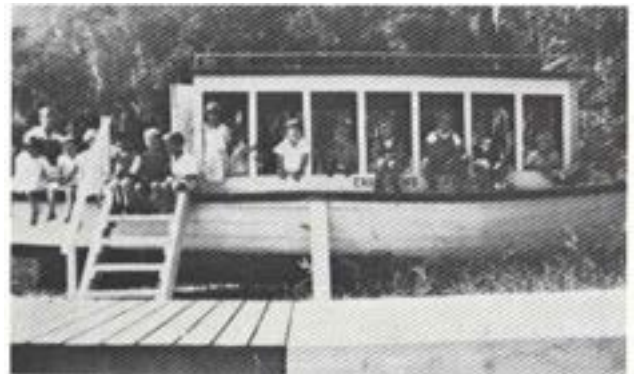
The Blue Lantern boat carried people for a ride on Lake Geneva.