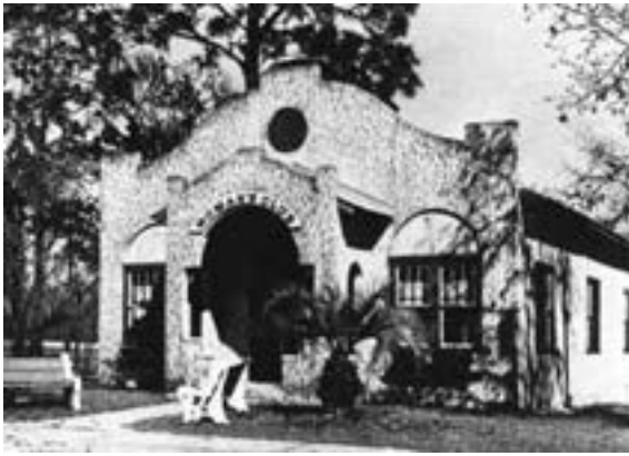
Woman's Club Building