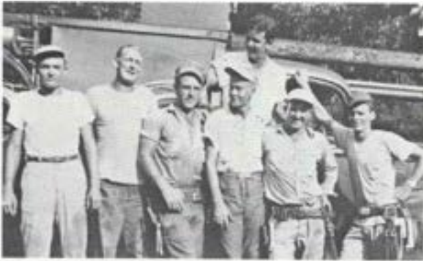
One of the early line crews of Clay Electric Cooperative.