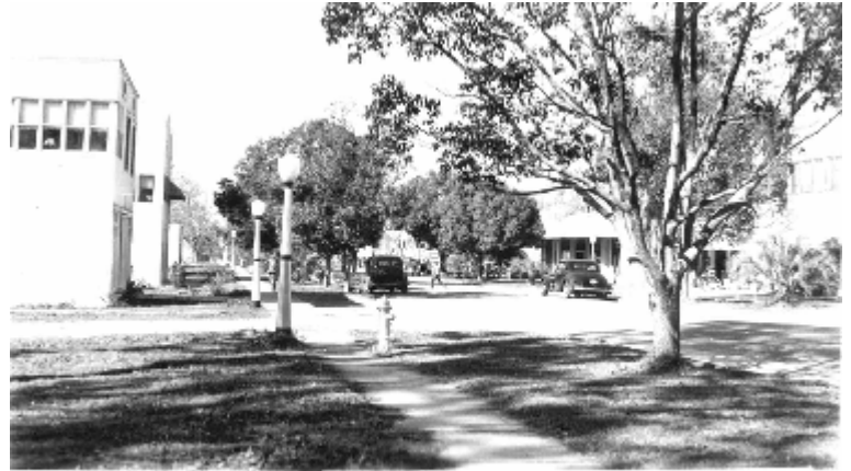
Keystone Heights, Fla

The Keystone State Bank was the first bank in town and it was originally located at the site of today's Mallards dime store. It opened in 1952 and was moved to the present building in 1955. The building was enlarged in 1961 and 1973.