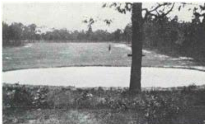
The first golf course with sand greens.