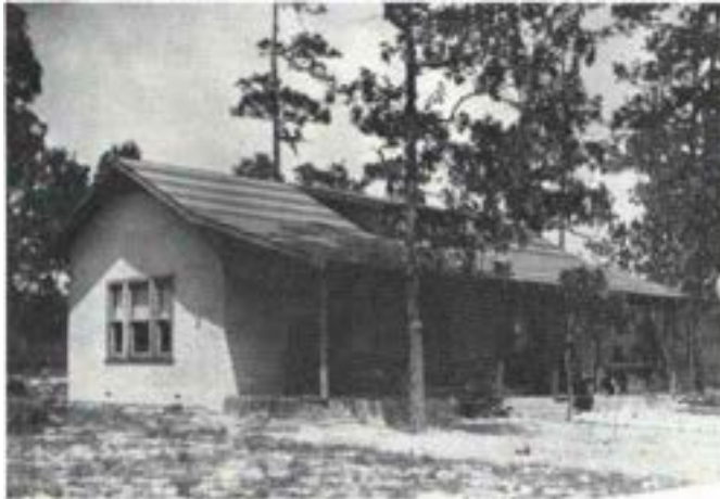
Keystone's first Woman's Club building.

Keystone Inn was the scene of meetings, community sings and other similar happenings from the time of its opening. The Woman's Club was used for programs and suppers.