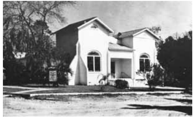
THE KEYSTONE HEIGHTS COMMUNITY CHURCH, KEYSTONE HEIGHTS, FLA.