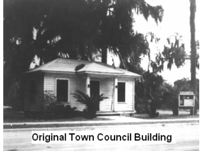
Original Town Council Building

An important period in the area's growth was the advent of the Chautauqua. A large, rather rustic building was constructed on the site of the present Woman's Club. Many artists, speakers, musicians, etc reached Keystone Heights by way of the Chautauqua Circuit from the original Chautauqua in New York State. Thus, the name Chautauqua Circle came into being. These people were lodged in the Keystone Inn. Naturally, it was an anticipated event for the girls and younger women of the community because they were always needed to help "wait tables." Following a Chautauqua season there were enough amusing anecdotes circulating to last until the following year.