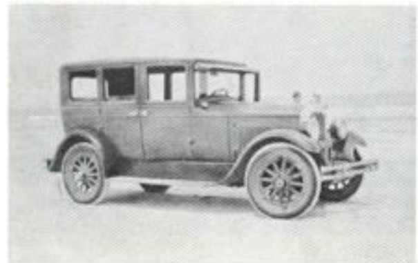
The "Company Car" of Lawrence Developing Company.