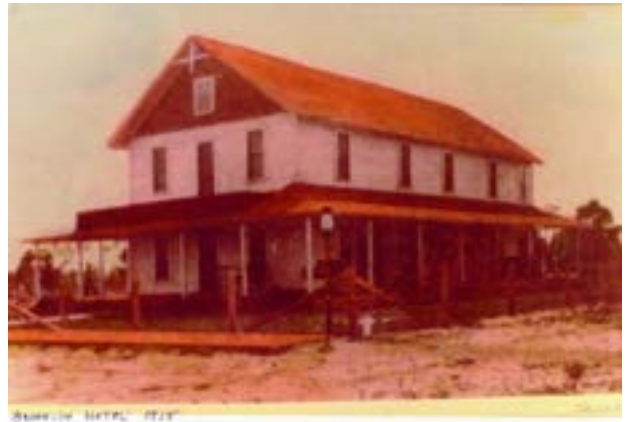
Brooklyn Hotel 1915